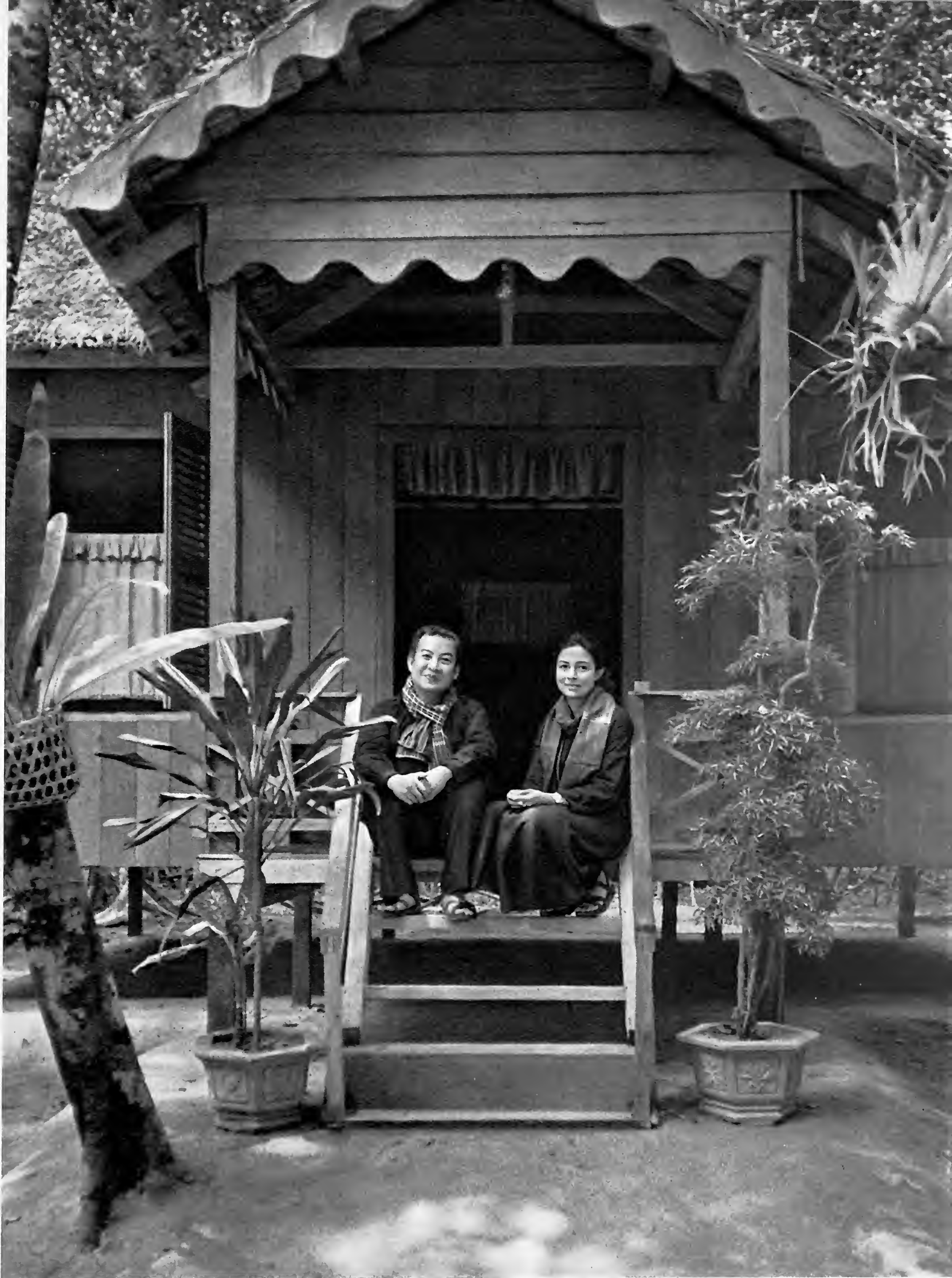
A charming residence arranged by N.U.F.C. members in Angkor for Head of State Samdech and Madame Sihanouk.